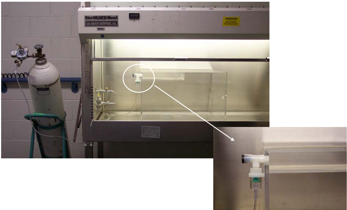
Figure 2. Madison Inhalation Chamber Apparatus for Aspergillosis